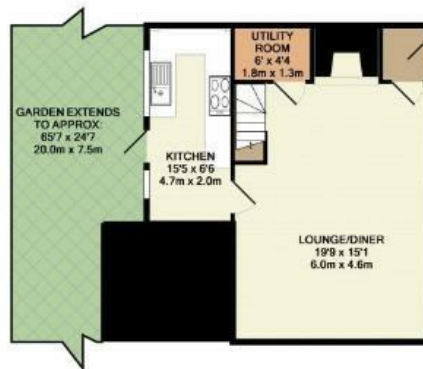
GROUND FLOOR APPROX. FLOOR AREA: 43.9 SQ.M. (462 SQ.FT.)