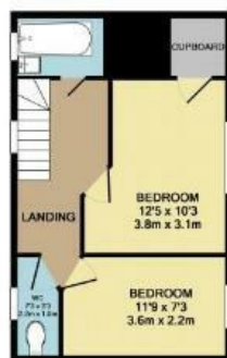
1ST FLOOR APPROX. FLOOR AREA: 31.8 SQ.M. (343 SQ.FT.)